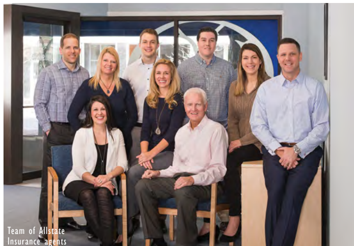
Team of Allstate Insurance agents

Change is inevitable at home as well as in the business world. With the significant increase in distracted driving, the auto insurance industry specifically has changed a lot in recent years and created new technology that helps monitor driving behavior. This technology modernizes the auto insurance by providing feedback on driving behaviors to give customers personalized, real-time insights into how they can drive safer and earn cash rewards for doing so.