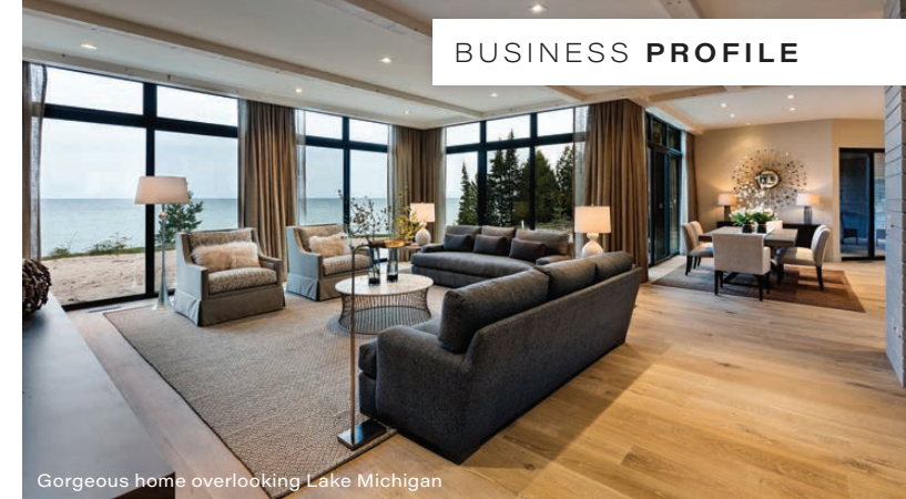
Gorgeous home overlooking Lake Michigan