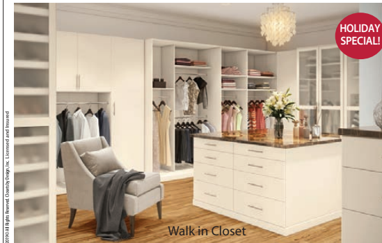
Walk in Closet