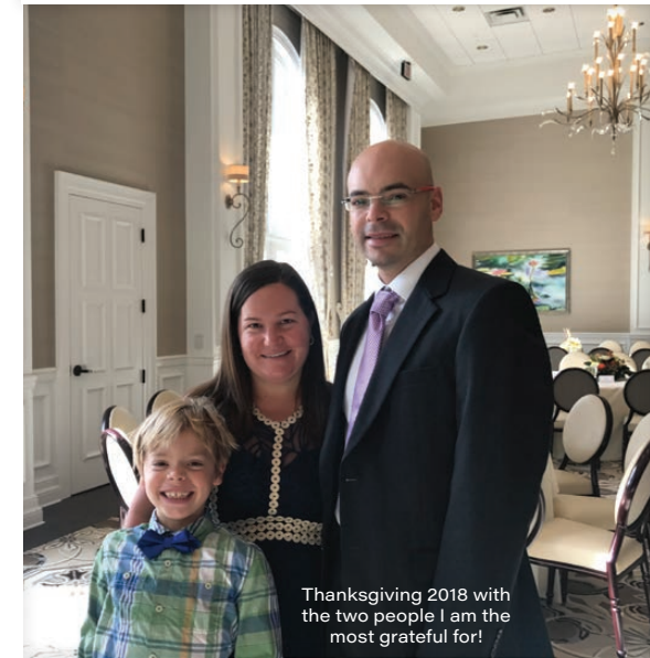
Thanksgiving 2018 with the two people I am the most grateful for!

Having been on the receiving end of a meal train this past year, I can relate to what an incredible help it was after surgery. From this experience I did pick up a few fun ideas that I have since incorporated when now bringing a meal to a friend in need. A bonus that I had never thought of is including something for breakfast the next morning. This ranged from a quiche, cut up fruit, or a kringle. Also the surprise dessert of Kopp's custard or an Elegant Farmer apple pie was a unique way to end a meal! The next time a meal train link is sent your way, please know how grateful that family will be to receive a meal.