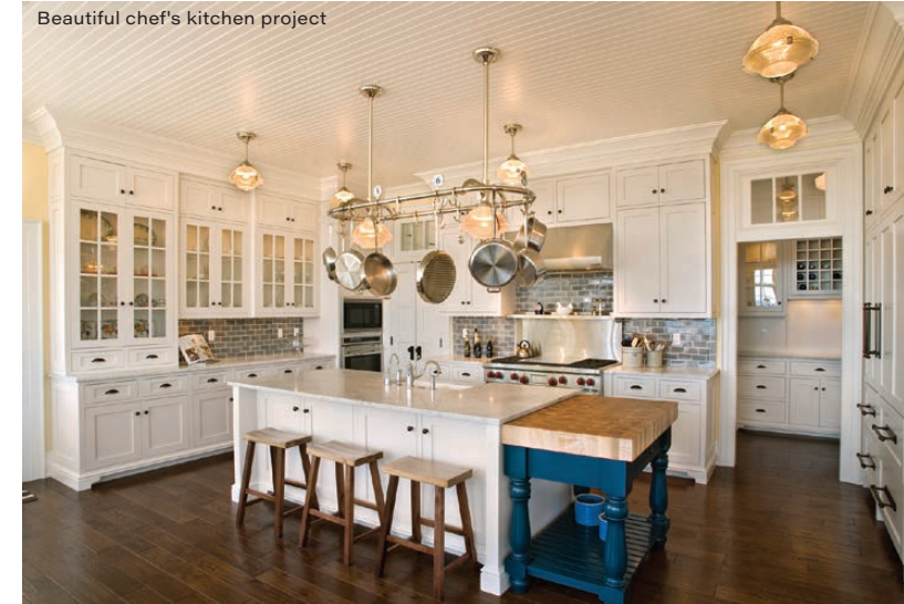
Beautiful chef's kitchen project