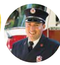
BY CAPTAIN DAN TYK