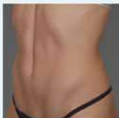
10 Days After 4 CoolTone™ Treatments

A non-surgical solution that strengthens, tones and firms targeted areas of the body.