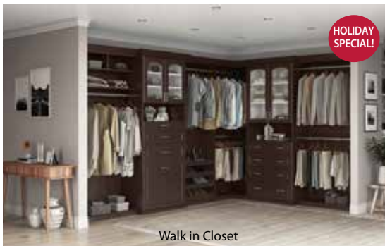
Walk in Closet