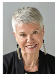
Yours in fashion in the Time of Covid-19,

The word "polished" is creeping into editorial, and we are sensing a shift.