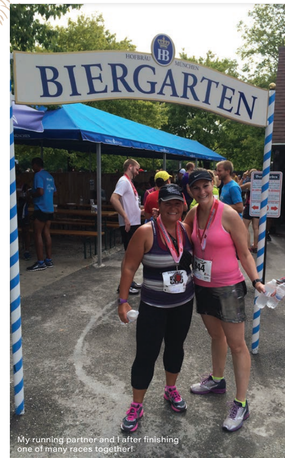
My running partner and I after finishing one of many races together!