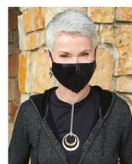
Yours in fashion in the Time of Covid-19,